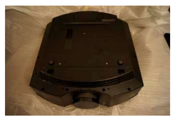
M5 Screws with spacers for Sony projectors.