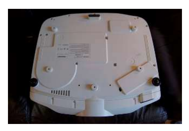
Figure 2 - Bottom of an Epson EH-TW9200W